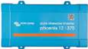
Phoenix 12/375 VE.Direct