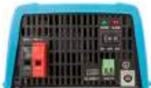
Phoenix 12/375 VE.Direct